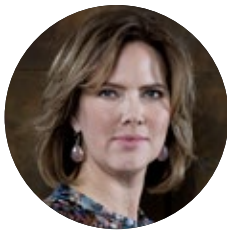
Cora van Nieuwenhuizen

Minister of Infrastructure and Water Management